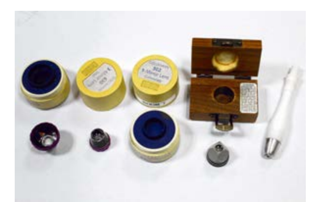
The GonioPEN (right) compared with a traditional glass gonioscope, which is pressed against a patient's eyeball and is linked to a microscope, into which a doctor peers.